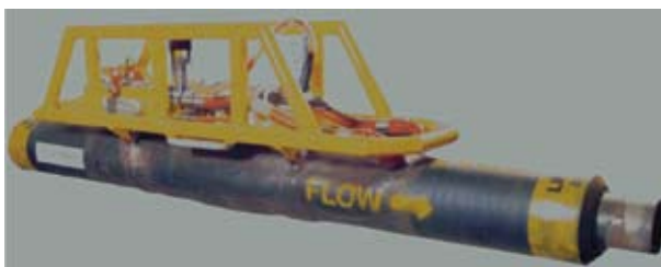
Figure 3. Typical FSM deepwater system installed on pipe spool prior to offshore installation, complete with subsea electronics and protection frame.

The growth in intelligent field devices, increased automation, expanded communication networks, and improved compatibility with IT have all helped SCADA generate real-time information from remote environments – information that can go straight to the operator desktop.