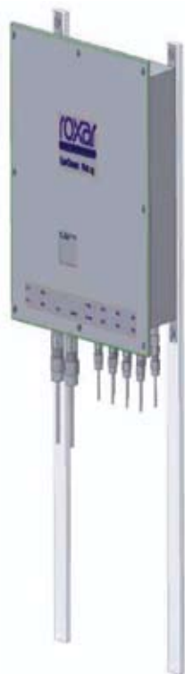
Figure 4. FSMLog instrument.

pipelines and ensuring a reliability of supply. Corrosion is also often caused by the presence of carbon dioxide in the gas, with the corrosion rate highly dependent on